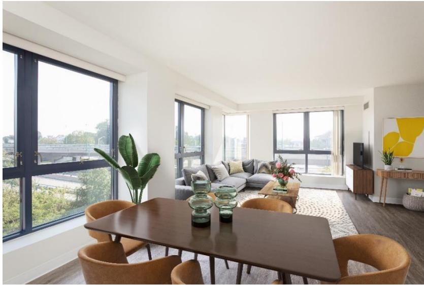
Property Interior (Renovated unit)