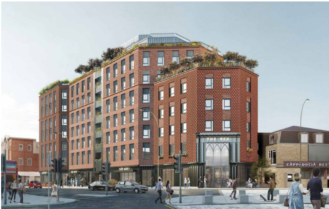
Property Exterior CGI

This is the first residential development project in the UK and the existing four-story student accommodation will be converted into a nine-story, one-basement residential rental building. Construction is scheduled to begin in the first half of fiscal 2023 and completion in the second half of fiscal 2025.